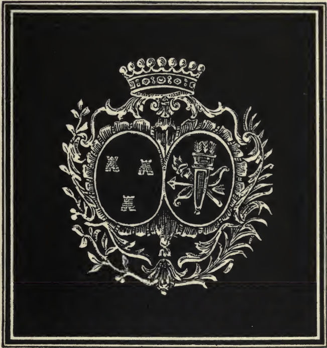
MADAME DE POMPADOUR.